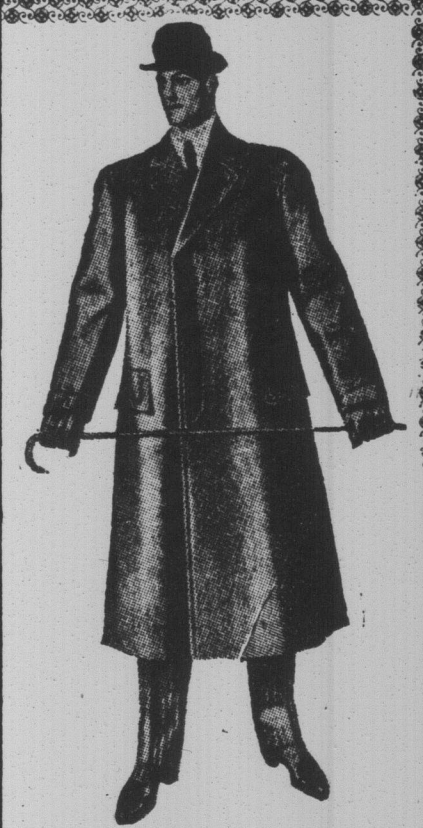
est Style and Quality hit All