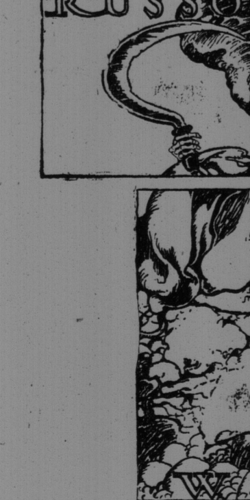
February 6, 1904—Three years ago today war was declared between Russia and Japan. Find a Russian and a Jap. ANSWER TO YESTERDAY'S PUZZLE. Left side down, against right arm.