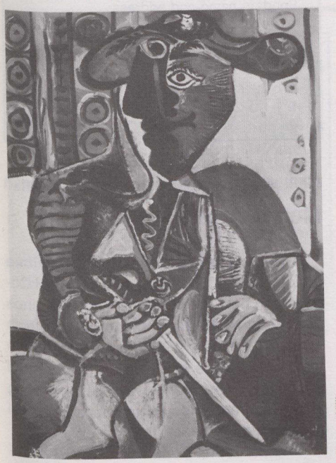
The Matador, painted October 14, 1970.

A unique exhibition containing the largest group of previously unexhibited Pablo Picasso masterpieces, is being presented exclusively at the Montreal Museum of Fine Arts. The exhibition has drawn thousands of visitors since it opened on June 21. It is scheduled to close on November 10.