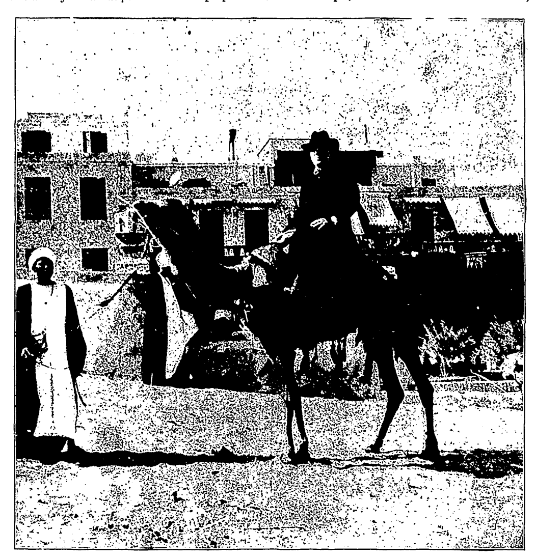
THE CHIEF STARTING FOR THE GREAT PYRAMID.

fully illuminated inside and out, and proceeded to the residence of the Doctor on Carlton St., whence he was escorted to the glorious monument of his achievement, where the proceedings of welcome took place. Along the entire route down Jarvis street, along Queen to Victoria, down Victoria to Richmond, and to the corner of Bay street, the procession attracted much attention from the crowds of people who were abroad. Arrived