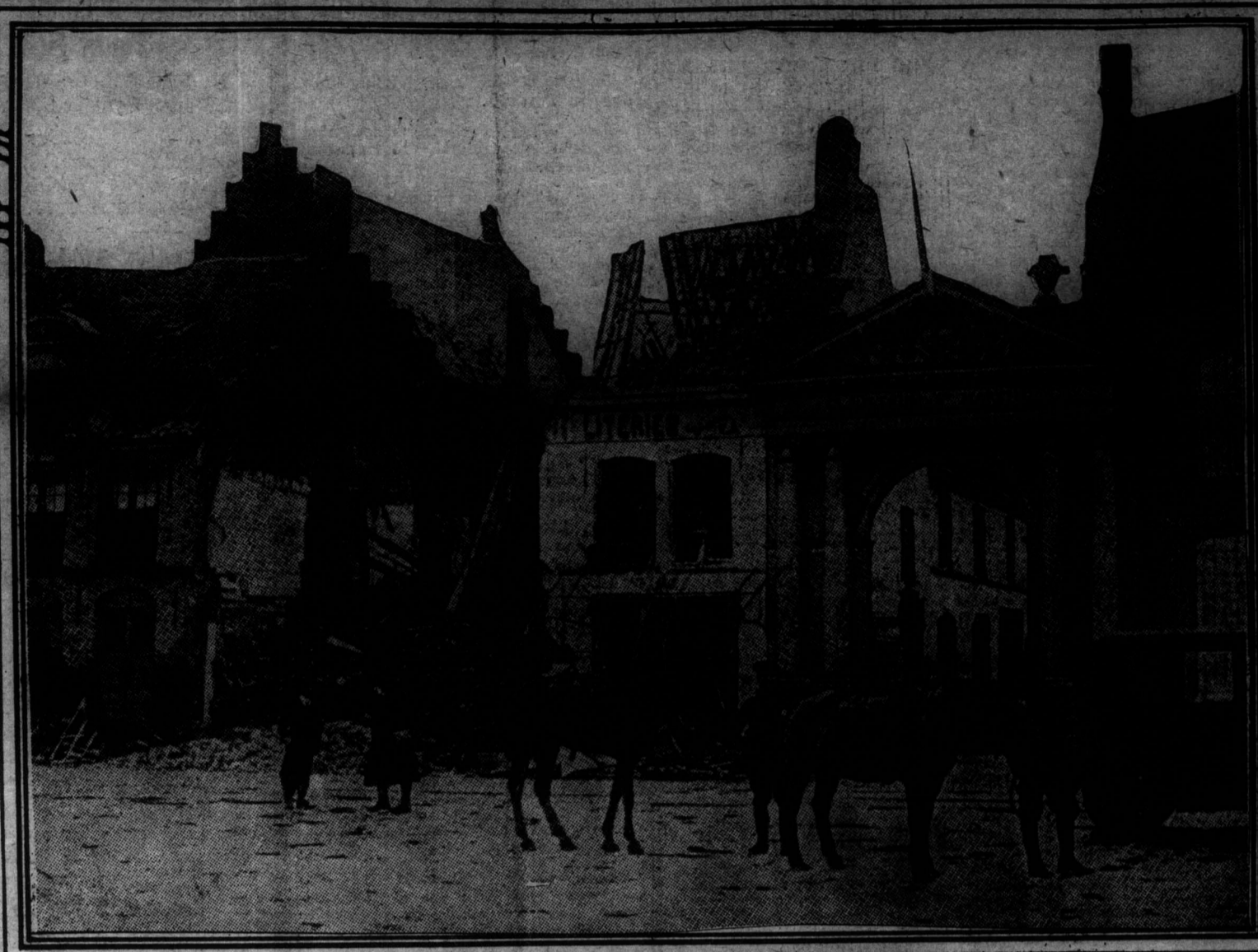
BUILDINGS IN YPRES SHATTERED BY SHELL FIRE. In the above picture is shown the destruction wrought on some of the fine old buildings of Ypres. The town is now in a most pitiable condition. It has for many weeks borne the brunt of the heaviest fighting yet experienced in the present war, with disastrous results. Formerly it was one of the most beautiful towns in Belgium, boasting of almost perfect architectural beauty.