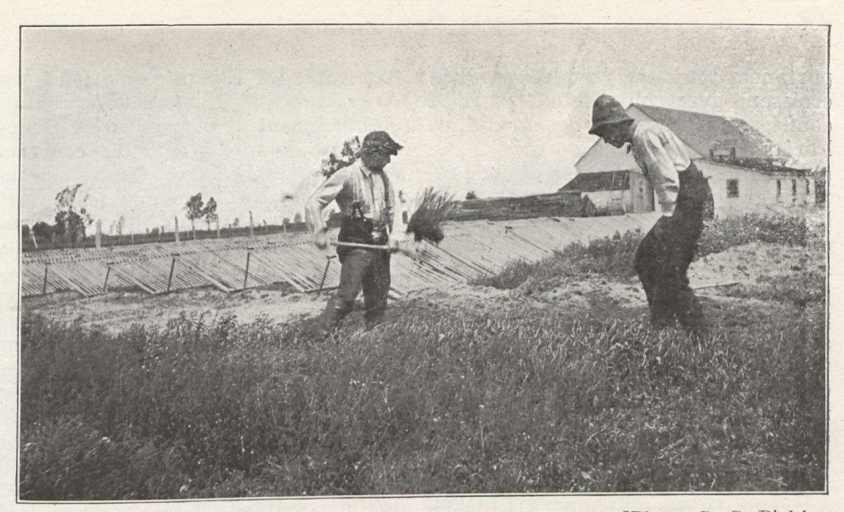
Students of Laval University Forest School at work at the Provincial Government's Nursery, Berthierville, P.Q.