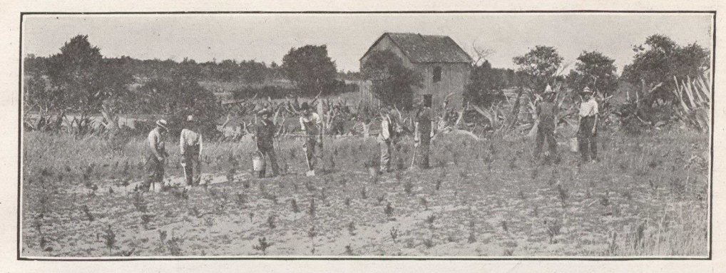
O. A. C Students working on Ontario Government plantations, Norfolk Co.