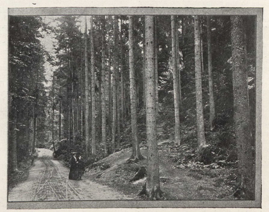
Swiss Municipal Forest used also as a Park.

land bears productive forests and the income is in consequence comparatively low. Moreover, the Heidelberg forest is managed as much from the aesthetic as from the business standpoint. Utility and productivity are in many instances sacrificed to beauty; the forest is made to serve as a park. Yet, though it is a young, unproductive forest, though it is kept in a condition which would put to shame many of our parks,