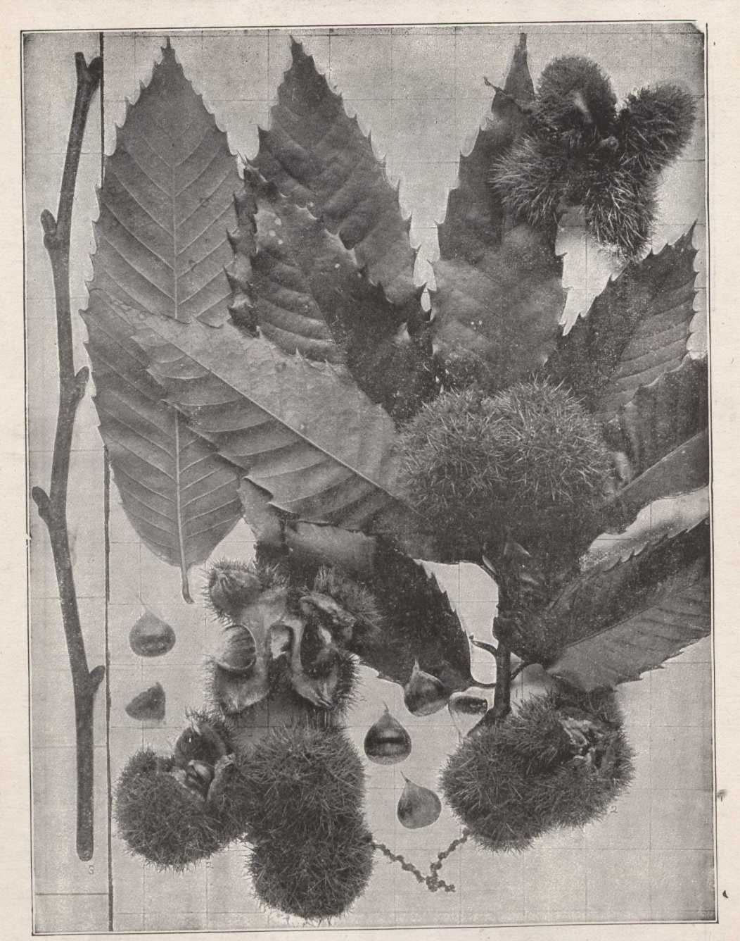
(An illustration from the HANDBOOK OF THE TREES OF THE NORTHERN STATES AND CANADA, PHOTO-DESCRIPTIVE, by Romeyn Beck Hough, B. A.

Two pages facing each other are devoted to a species, and this with its caption and legend comitted here) is one of the two relating to the Chestnut. Observe the background is ruled into square inches to indicate sizes. The other page bears a beautiful picture of the characteristic bark of the species, a photo-micrograph of wood structure, a map indicating distribution, and a carefully prepared text. In this way all of the trees are treated. (See this page in March 1881e.)