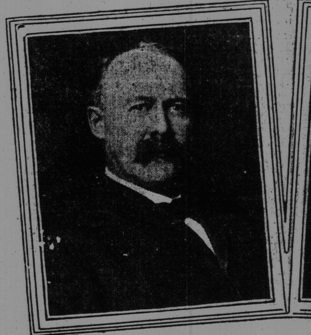
FREMONT WOOD . JUDGE WHO WILL