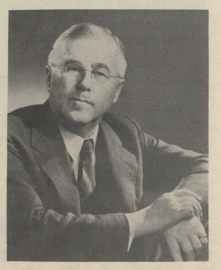
JUDGE JOHN E. READ

The jurisdiction of the Court comprises all cases which the parties refer to it and all matters specially provided for in the Charter of the United Nations or in any treaties and conventions. State parties to the Statute are, however, free to entrust the solution of their differences to other tribunals. Parties to the Statute may make a declaration accepting the Court's compulsory jurisdiction in certain specified classes of legal dispute, those which can