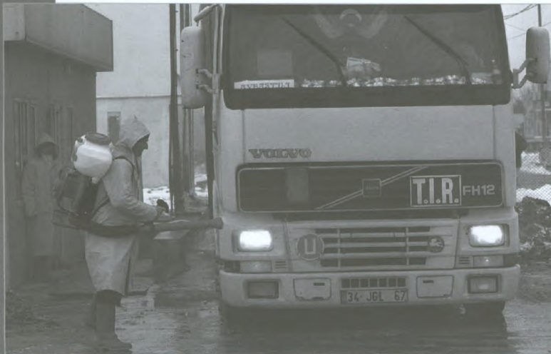
A Romanian health worker sprays bird flu disinfectant on a truck transporting goods from Turkey, where there was an outbreak of bird flu cases in humans.

see page 2 - Experts say avian flu potentially devastating