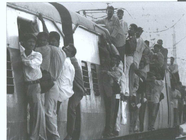
The revamping of India's transport system is still in low gear.

It all adds up. From April to September 2004, for example, India's GDP growth stood at 7%, despite a weather-related drop in agricultural output. According to the Indian Ministry of Statistics and