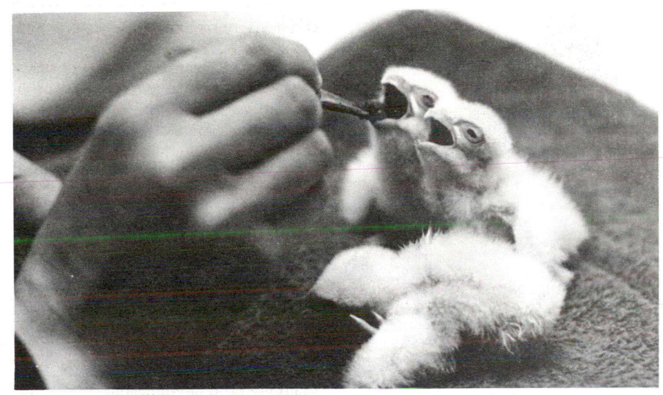
Newly-hatched peregrines are awkward bundles of creamy white down with

This work in Canada is closely linked to a similar program in the United States, run from Cornell University. The Cornell team is also releasing captive-raised peregrines. The CWS effort has been possible through the co-operation of the provinces and the territories, who have the responsibility for protecting peregrines. Alberta and the Northwest Territories have been especially active in support of the CWS project.