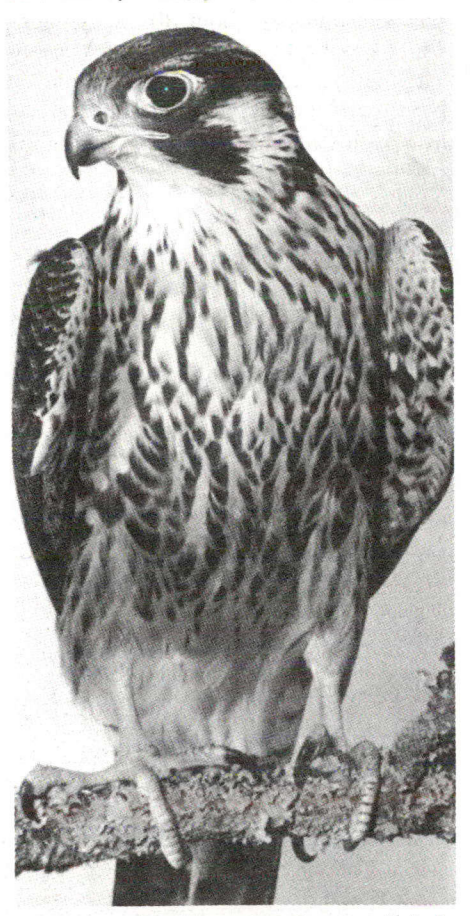
Ever since the nomads of central Asia first pursued game with trained hawks and falcons, the peregrine falcon has been a favourite of falconers. Now an endangered species in North America, the peregrine may survive if an experiment conducted by the Canadian Wildlife Service succeeds.

disproportionately large feet (and mouths, too, at feeding time).