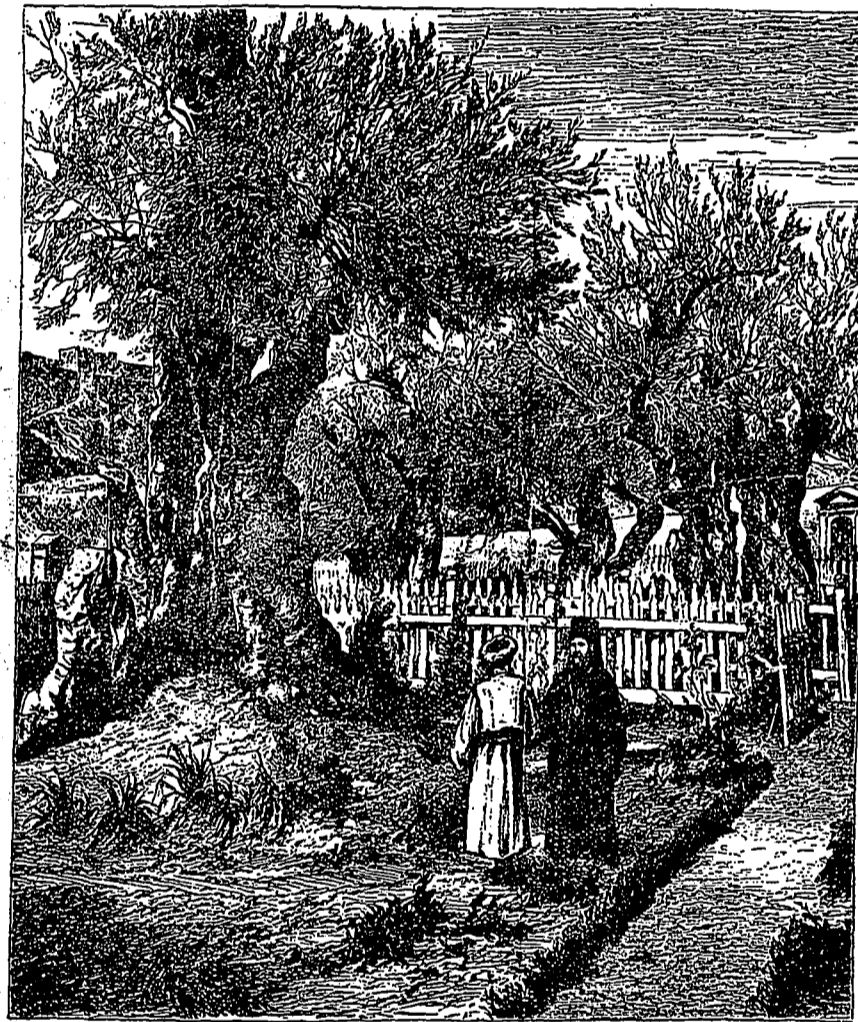
GETHESEMANE AS IT IS.