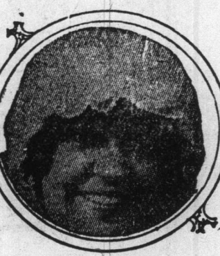
CARE OF THE FEET.

With the consuming passion for smart little high heeled shoes and boots, broken arches and tired feet, like the poor, will always be with us. But exercise will give considerable aid to overcome this affliction and will entirely eradicate it, if followed faithfully.