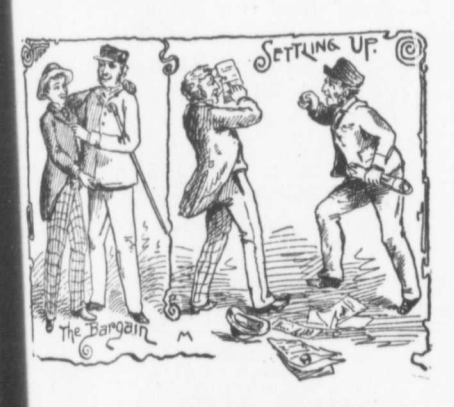
KEEPING BEES ON SHARES.

There are cases, doubtless, where it is advantageous to both parties to