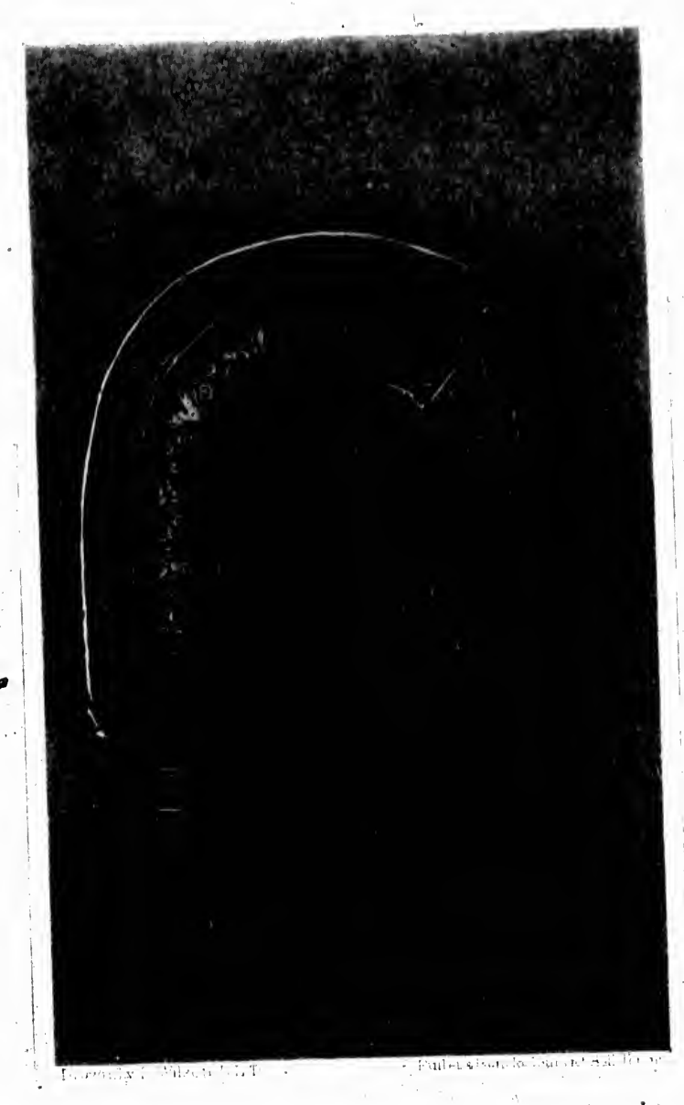
THE PUBLIC SHIP