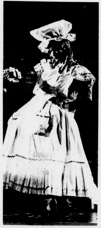
The young and lively Joffrey Ballet at the Royal Alex.