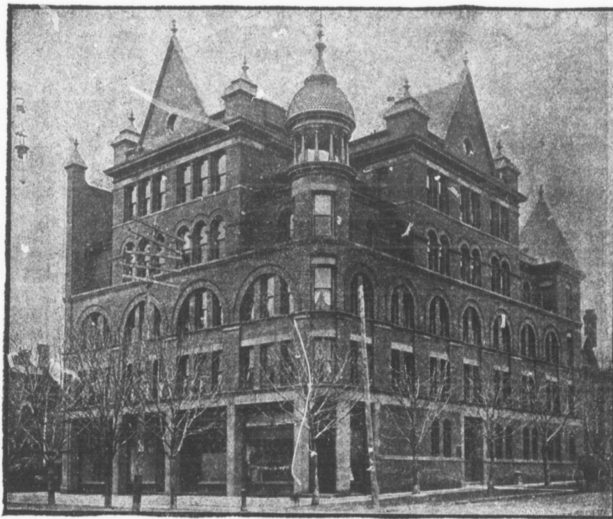
GRACE HOSPITAL (HOMŒOPATHIC)

MR. MR. MR. MR. MR. MR. MR. MR. MR. MR. MR. MR.