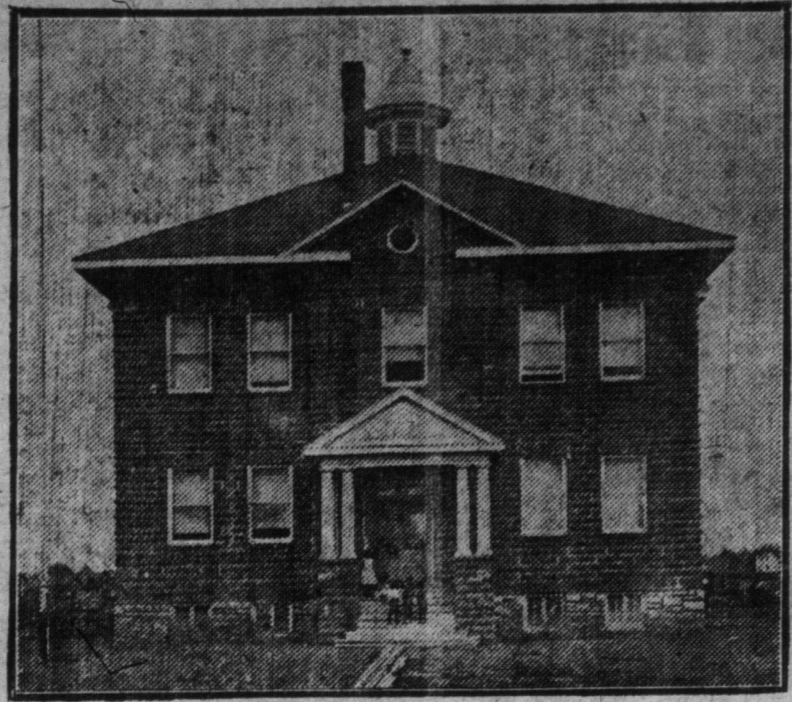
PUBLIC SCHOOL, NEW LISKEARD

One of The First ? The Home Seeker will ask is