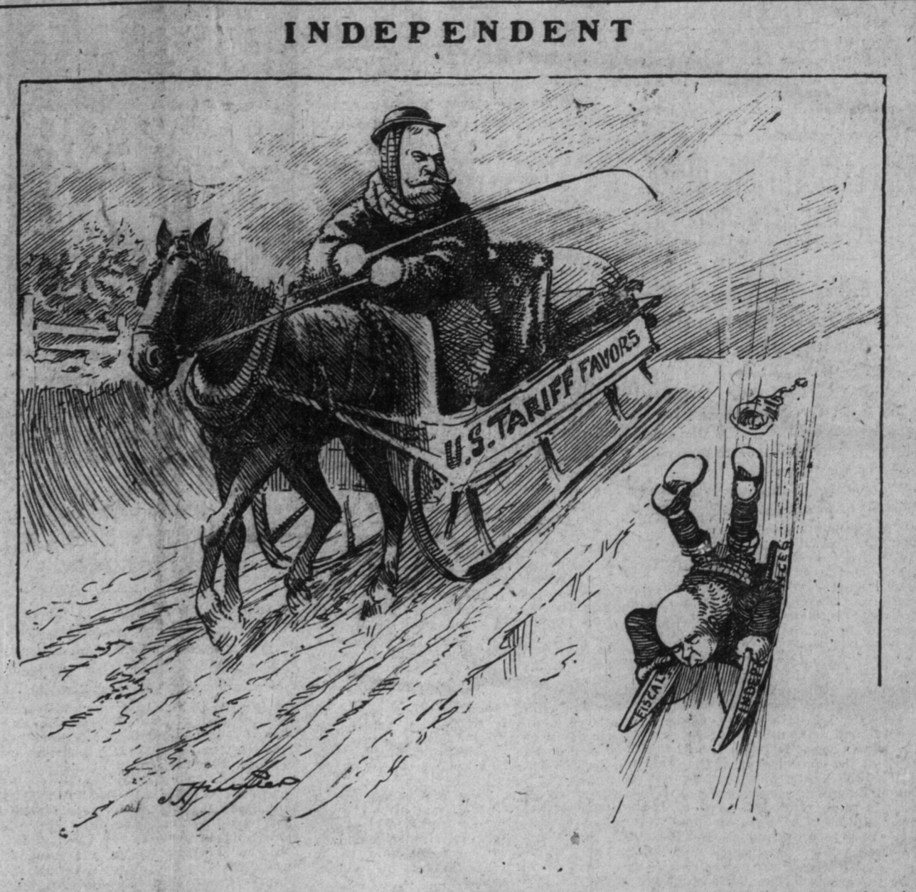
WILFY (who was once threatened with the whip): "Aw, gwan! Who wants to ketch on yer old sleigh?"

ONLY THREE VOLUNTEERS Women's Suffrage Association Will Conduct Street Campaign.