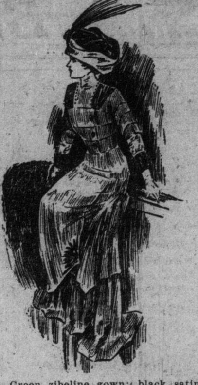
Green zibeline gown: black satin trimmings, shaded chenille embroidery of green.