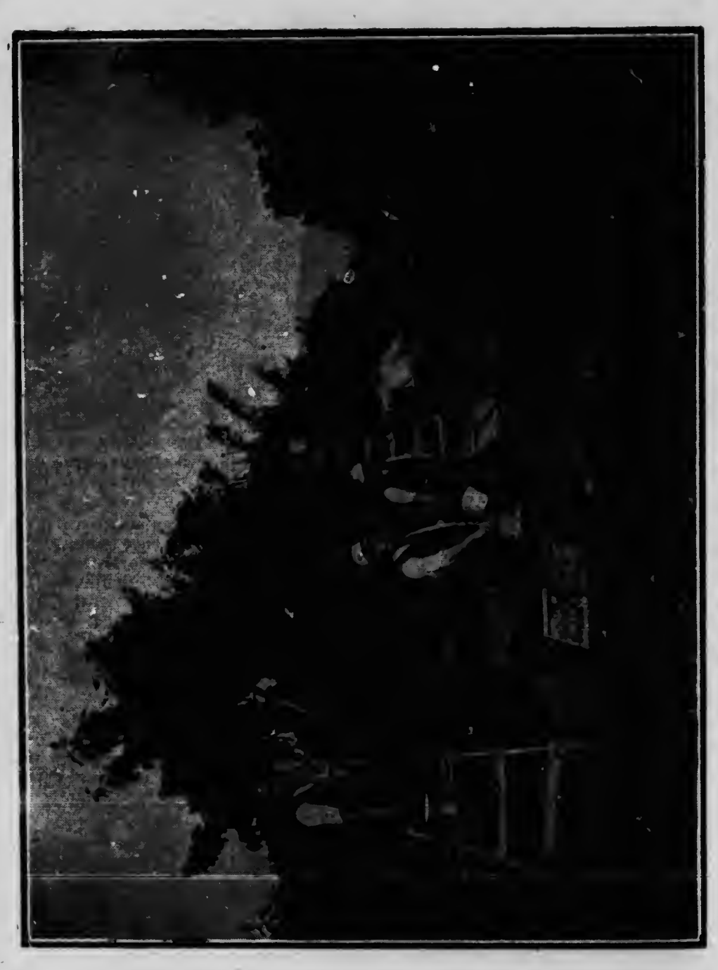
Picking Prunes in the Okanagan Valley. B.C.