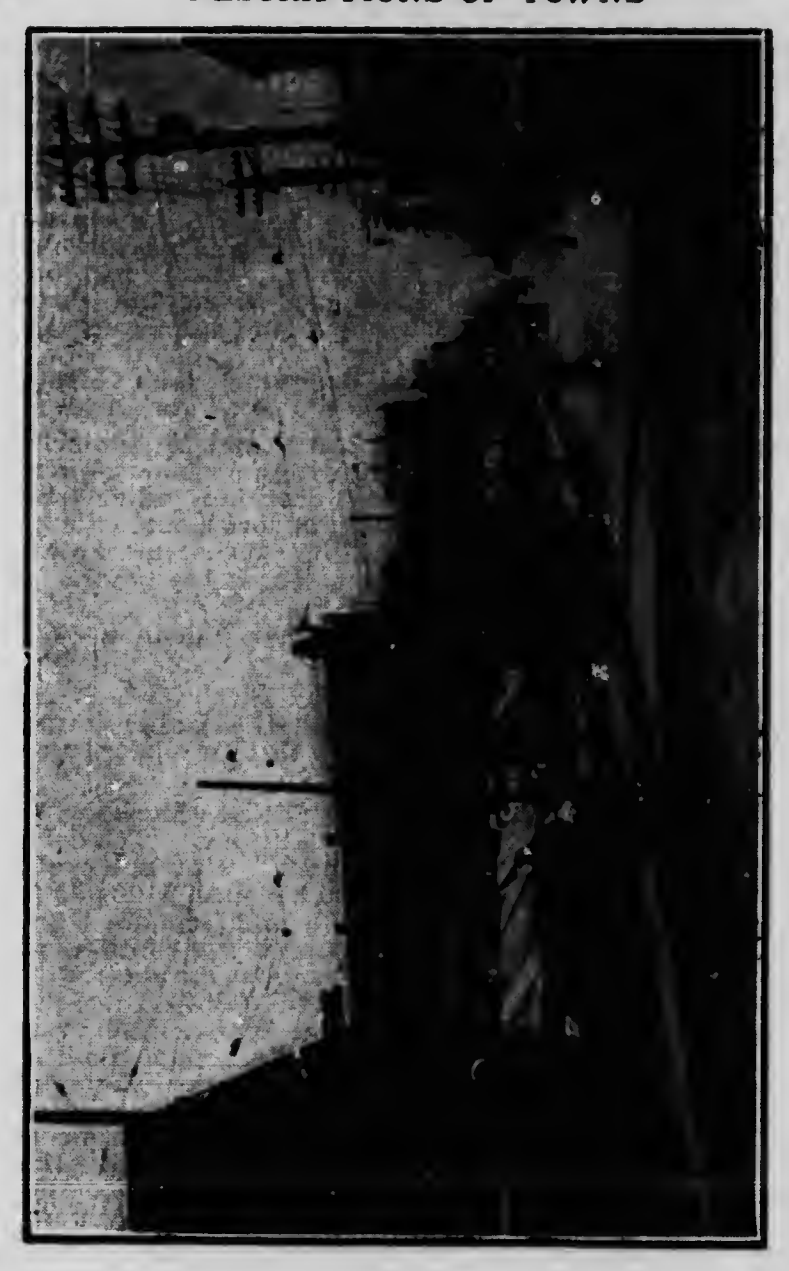
Columbia St., New Westminster