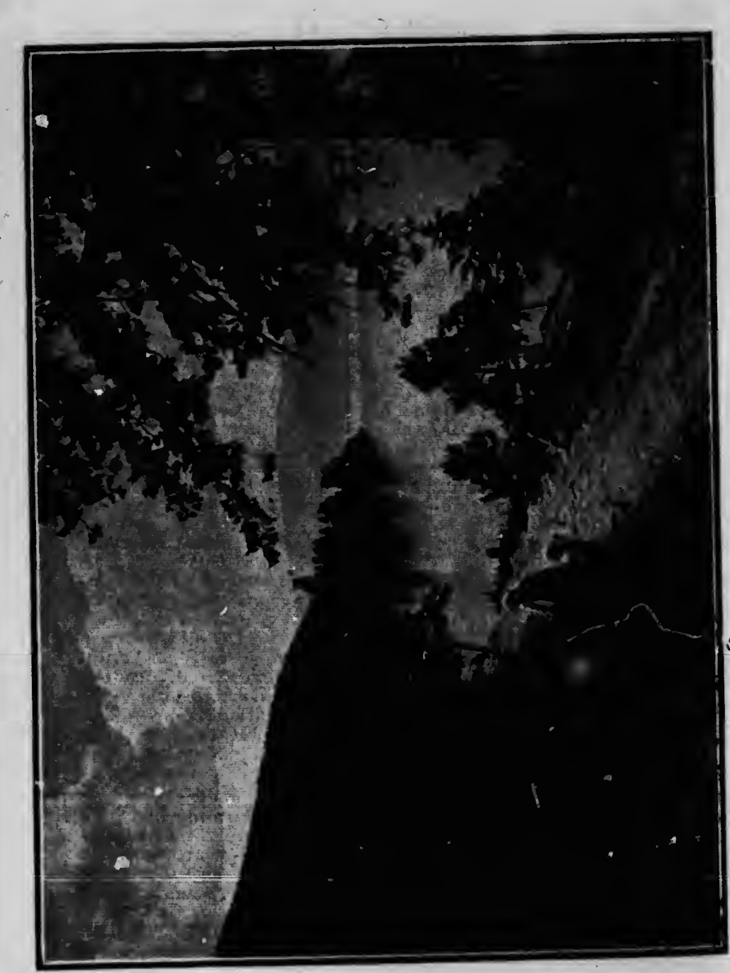
A Typical Bay on the Okunagan Lake, B.C.