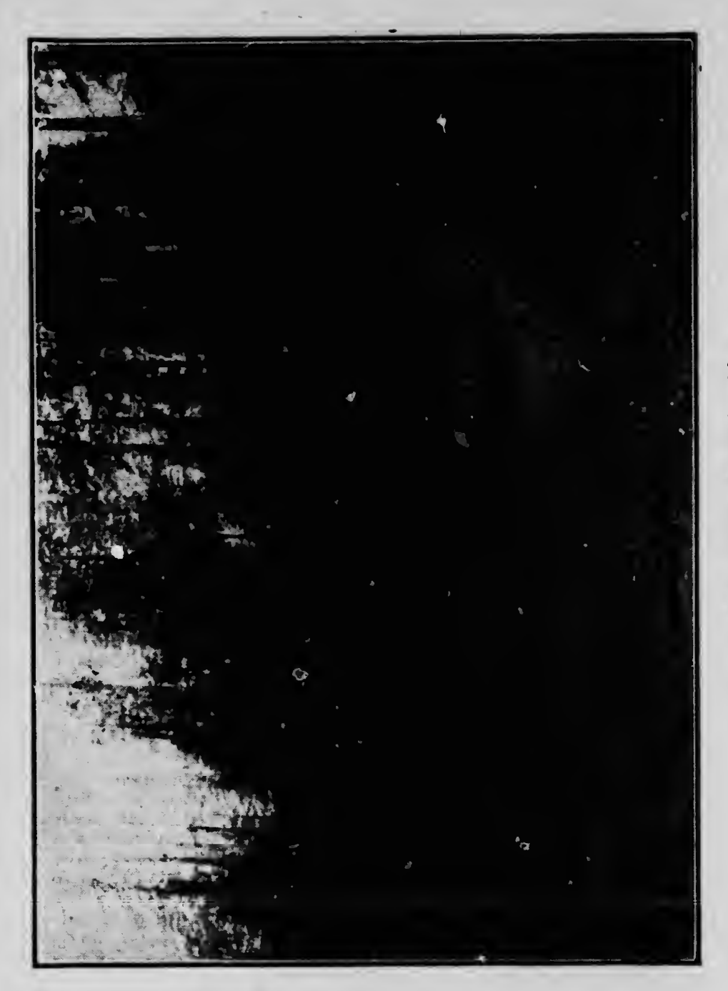
Logging in British Columbia