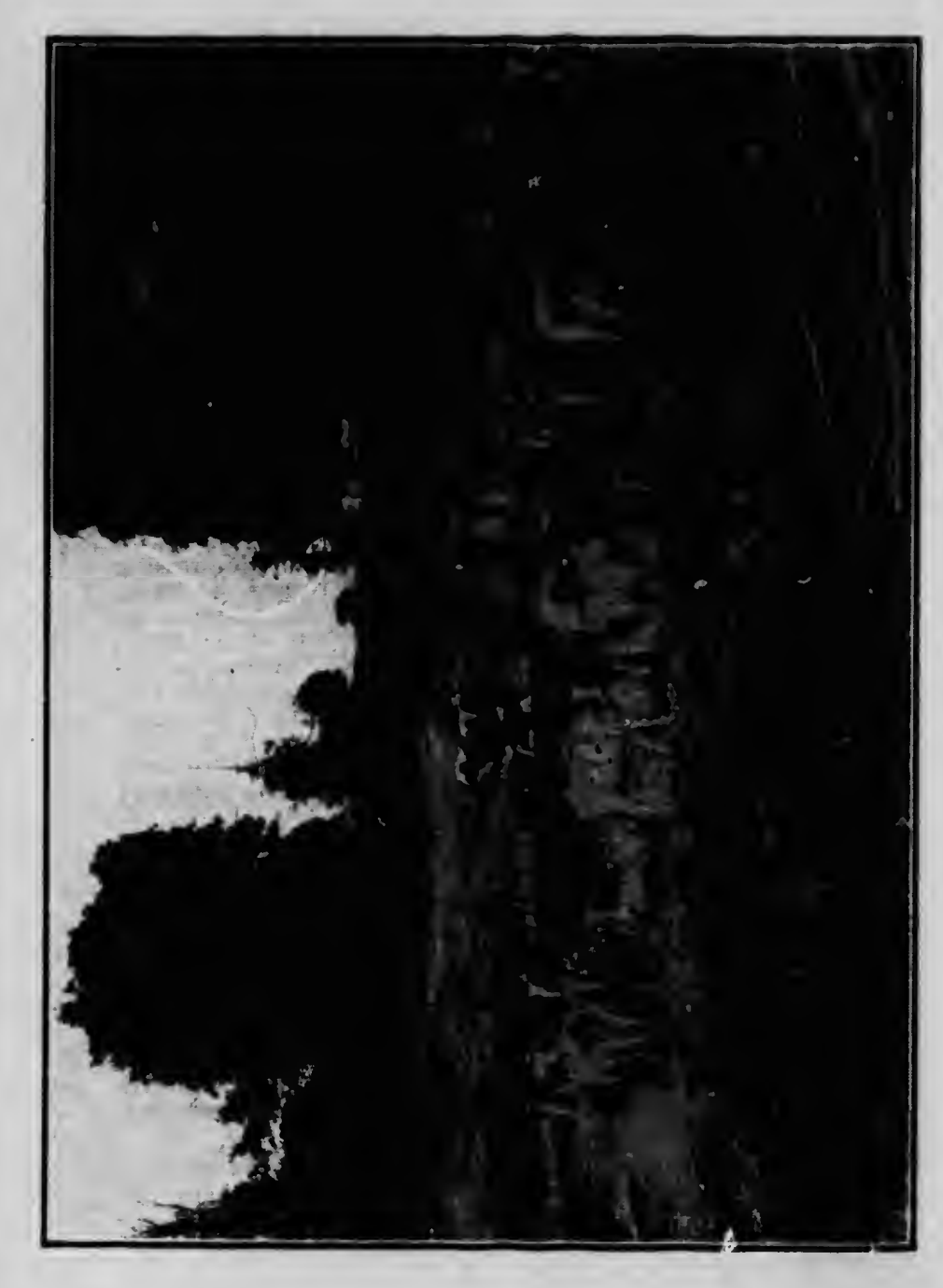
Country Scene on Vancouver Island, B.C.