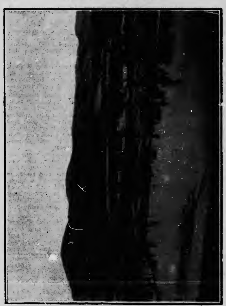
Fruit Lands, Kamloops, B.C.