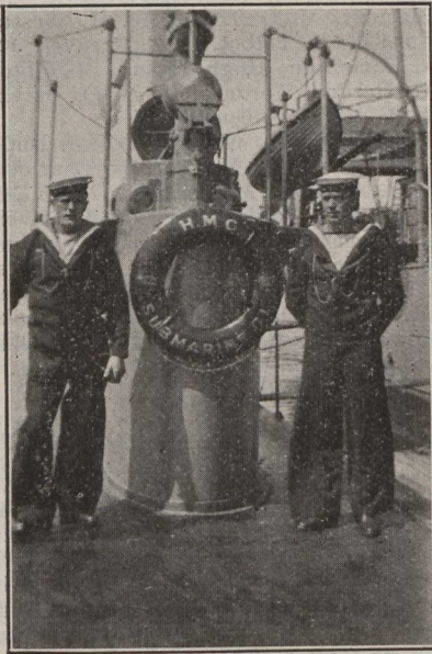
H.M.C.S. SUBMARINE C1, AT ESQUIMAULT.