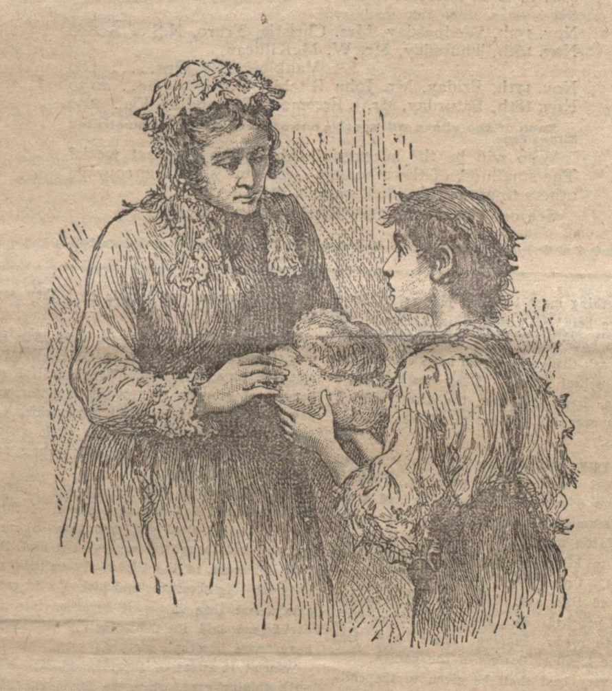
'INASMUCH AS YE HAVE DONE IT UNTO ONE OF THE LEAST OF THESE MY BRETHREN, YE HAVE DONE IT UNTO ME.'

Be not content to use your eyes, but practise your faith in God; neither be satisfied