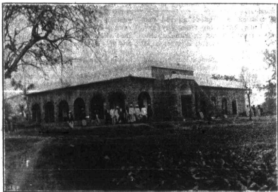
Pithapuram Mission House.