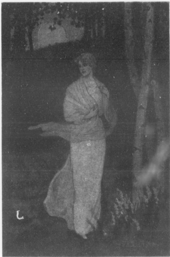
"ROSEMARY WEST STEPPED ASIDE FROM THE BY-PATH AND STOOD IN THAT SPELL-WEAVING PLACE"