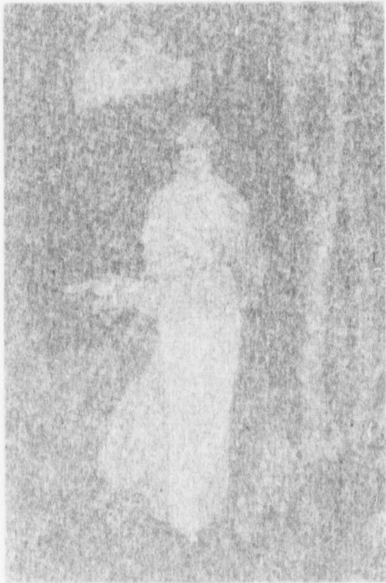
"ROSEMARY WEST STEPPED ASIDE FROM THE PYLITH AND STOOD IN THAT SPELL-CEASING PLACE"