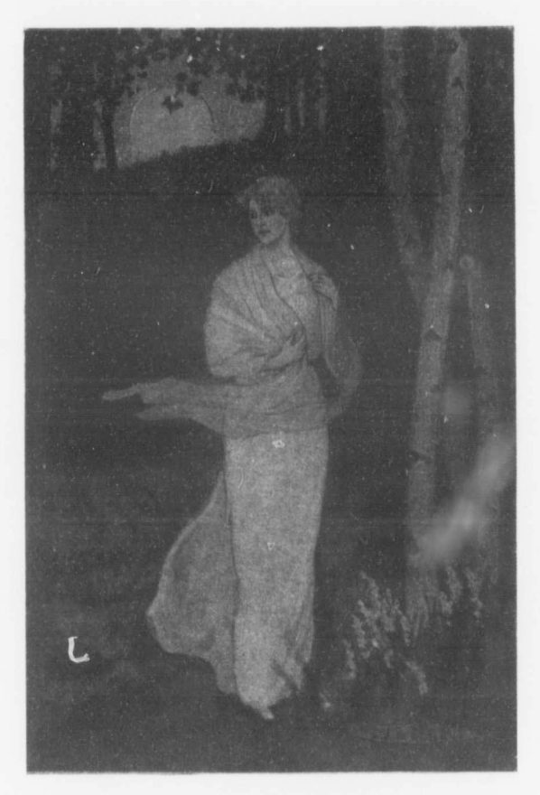
"ROSEMARY WEST STEPPED ASIDE FROM THE BY-PATH AND STOOD IN THAT SPELL-WEAVING PLACE"