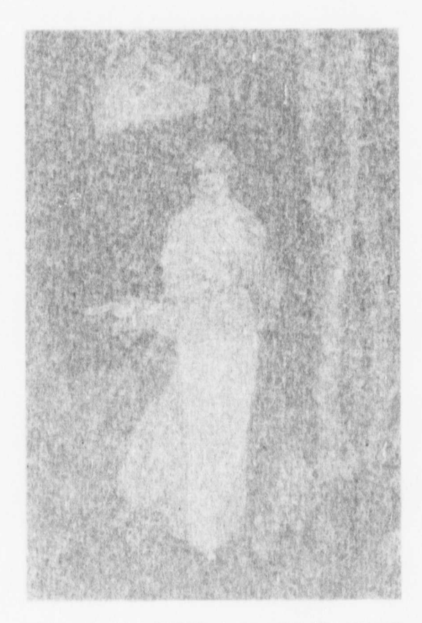
AND STOOD IN THAT SPEED ASDOC FROM THE BY LATH