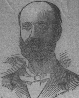
A Noted Lecturer Coming.

It is understood the Dominion government has decided not to assist fruit exporters who do not pack their fruit properly. We are told in Holy Writ that if a man will not work neither shall he eat.