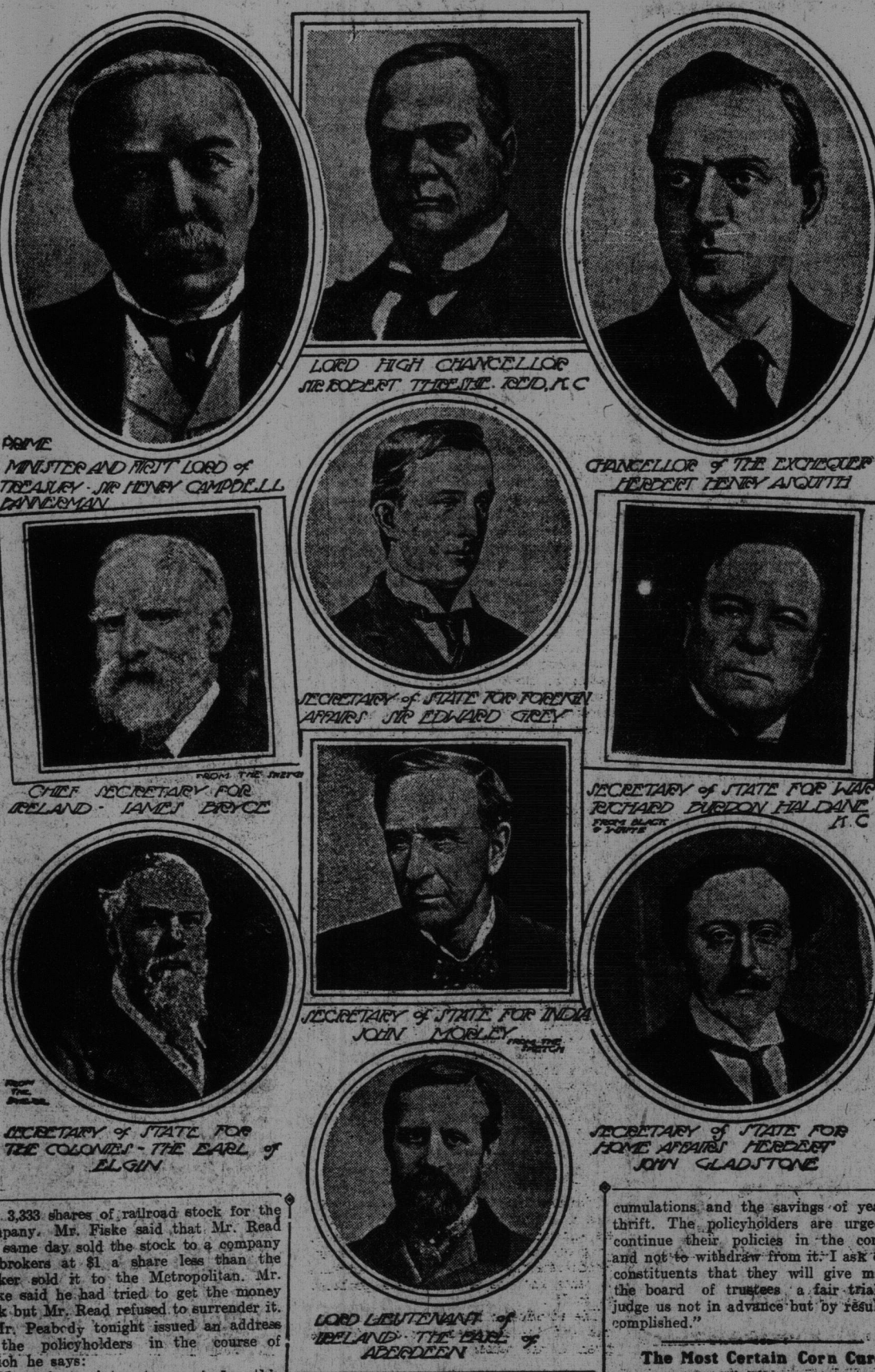
Lord High Chancellor, Secretary of State for Foreign Affairs, Secretary of State for India, Secretary of State for War, Secretary of State for the Colonies, Secretary of State for the Admiralty, Secretary of State for the Home Department, Secretary of State for the Navy, Secretary of State for the Air, Secretary of State for the Colonies, Secretary of State for the Admiralty, Secretary of State for the Home Department, Secretary of State for the Navy, Secretary of State for the Air.