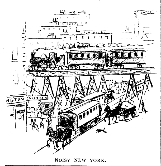
Just as much noise as it is possible to make is made in New York. All the streets of New York are paved with a stone of a particularly noisy character, and the stones are cut in a particular way, so as to make as much noise as possible. Overhead are the elevated railways, all made of iron trestle-work, so arranged that it will give out as much sound as Little, short trains go swishing and rattling along over the trestles, about three in every minute or the girls talk to each other, in imperfect English, at our so one way, and three in every minute or so the other Wawanosh Home. Soon an Indian girl tapped at our

morning of Friday. We sent our baggage by express waggon to the Pennsylvania R. R. depot, at the foot of Cortland street, and then proceeded, leisurely, to take the elevated railway to the same place.