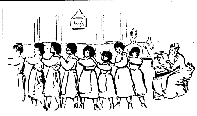
INDIAN GIRLS GOING TO BED.

After this I shewed the girls my sketches and photographs, and explained to them the large map which I had brought with me. It was now past eight, and