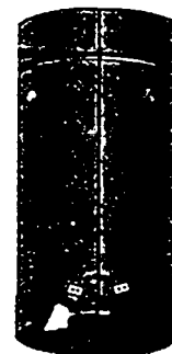
Close and Tight.

are the only pipes made that will expand to fit any pipe. They are made of the best of Canada plate, and are with- out doubt the CHEAPEST STOVE PIPE in the market