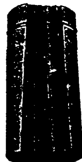
Nested in lots of 25.

Ask your dealer for the "Triumph" Adjustable Stove Pipes.