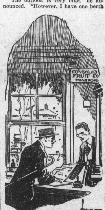
"The Outlook Is Very Blue."

"The outlook is very blue," he announced. "However, I have one berth