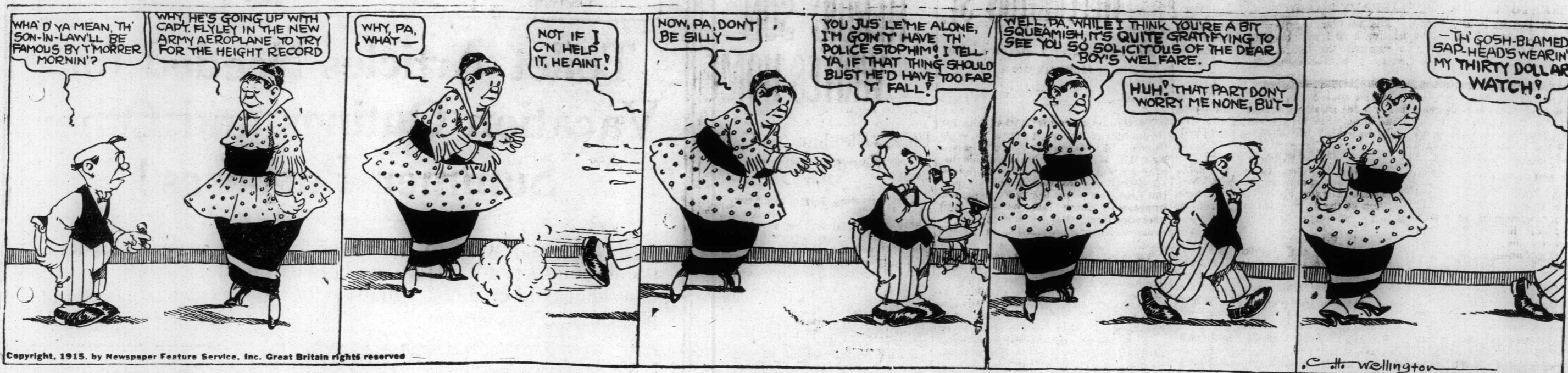
Copyright, 1915, by Newspaper Feature Service, Inc. Great Britain rights reserved