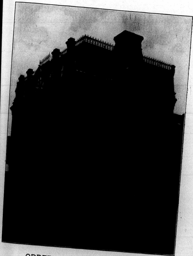
ODDFELLOWS' HALL, LONDON. THE PROPERTY OF THE LODGES.

Tuesday Friday Thursday Friday Monday Thursday Friday Monday Monday Monday Wednesday Monday Wednesday Monday Tuesday Thursday Wednesday Tuesday each month Thursday Monday Friday Thursday Tuesday Monday Wednesday Friday Monday Monday Tuesday Tuesday Tuesday Thursday Friday Monday Wednesday Monday Tuesday Friday Tuesday Tuesday Tuesday Friday Thursday Monday Friday Wednesday day Wednesday Friday