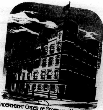
INDEPENDENT ORDER OF ODDFELLOWS HALL, Toronto.