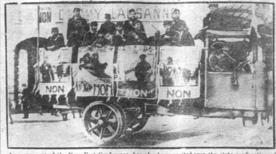
Lusanne, seat of the Near East Conference, has also been excited over the state confiscation of fortunes, which was defeated in arecent referendum. Here is a band-wagon parading the streets

of east or obligation, please send me full had about the majority before which I have been before which I have by the the life below? BEFARTMENT as Althousess. Presch