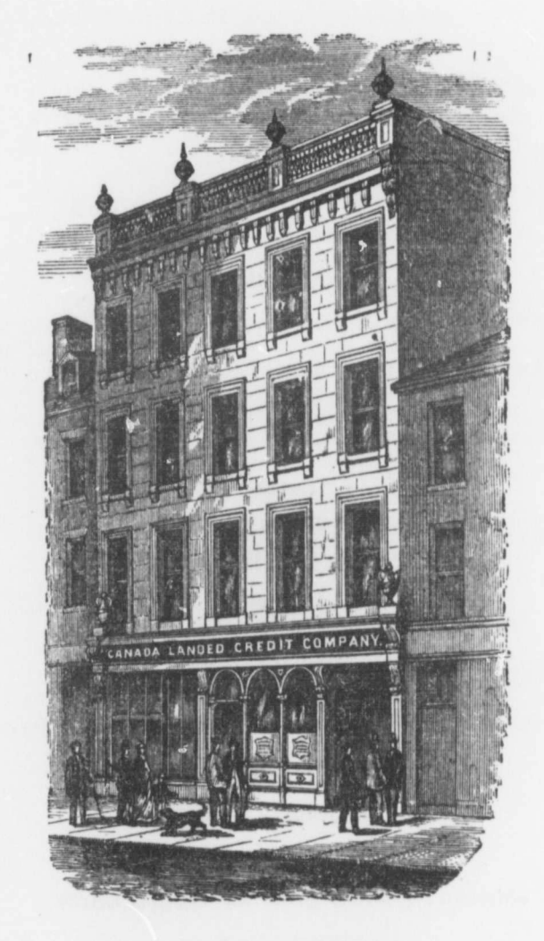
HEAD OFFICE: 22 KING STREET, TORONTO.