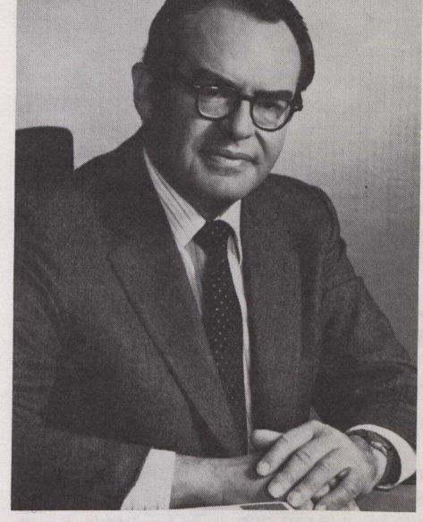
Minister of Industry, Trade and Commerce Herbert Gray.

The Israeli delegation said it would hold seminars this year to explain the Canadian market to new Israeli exporters. These are to be followed by Israeli trade missions to Canada and participation in the Hardware Fair scheduled for Toronto in 1983