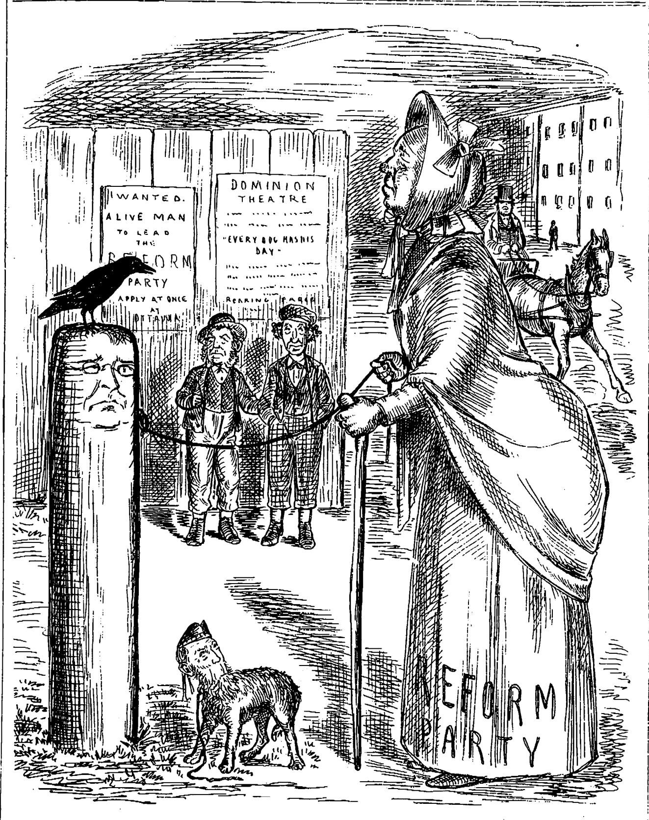
PROPOSED CHANGE IN THE LEADER-SHIP OF THE REFORM PARTY.