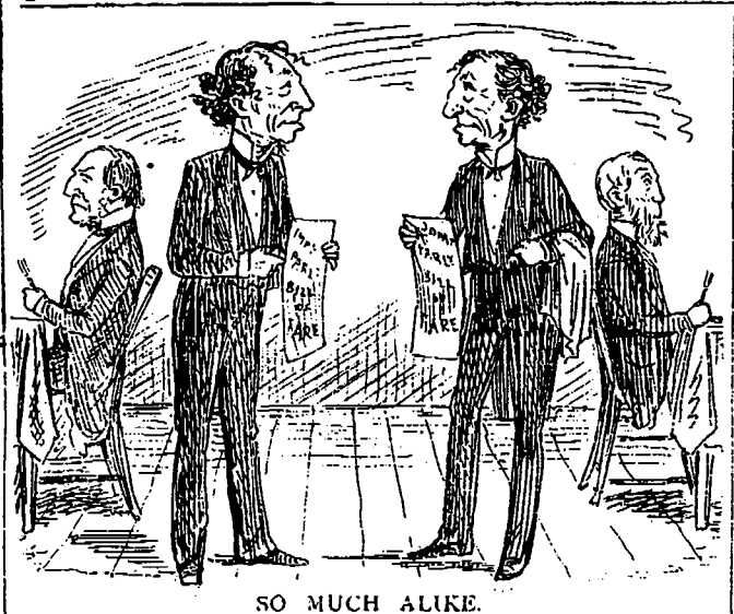
SIR JOHN-What are you going to give 'em at your table this time? EARL DIZZY-Very little of anything; what have you got?