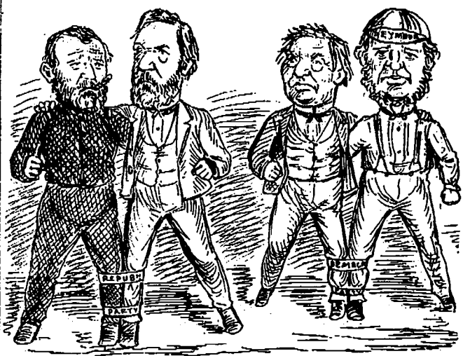
THE PRESIDENTIAL RACE.

" Town minds with but a single thought, Two hearts that beat as one."