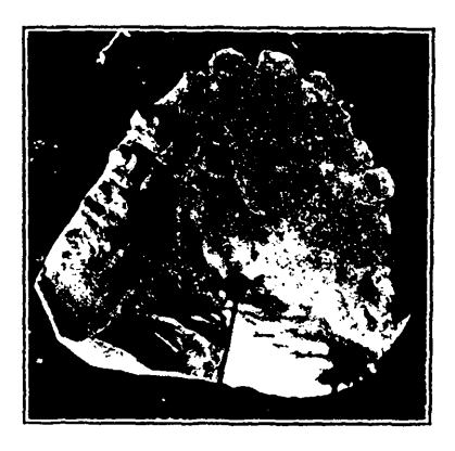
FIG. III. Pin through small opening.

the third case upon which the aluminum splint has been employed. The first one was in a child, aged 14, that had a very wide cleft which had been pronounced incurable, and it was advised that she wear an obturator. The cast of the mouth (see Fig. 3), was sent me a few days ago by Dr. Bennett, a dentist of St. Thomas. You will observe that union has taken place except at one pin point spot at about the junction of the hard and soft palate. This, of course, can readily be repaired.