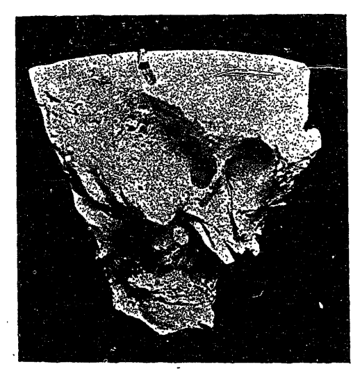
Fig. III. Temporal bone showing the dissection sometimes necessary in cases of chronic suppurative otitis media, complicated by mastoiditis. Practically all the mastoid cells have been removed.