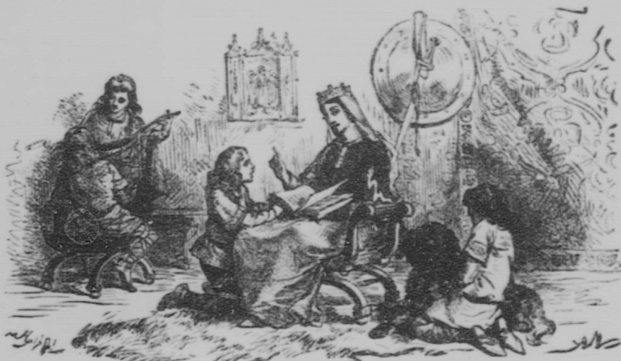
ALFRED'S MOTHER TEACHING HIM SAXON SONGS.