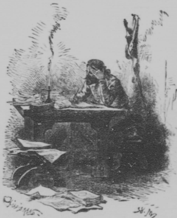
ALFRED THE GREAT IN HIS STUDY.