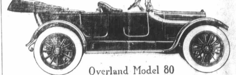
Overland Model 80

No advance in price on account of increase of 7 1/2% 'War Duty'. The price of an OVERLAND CAR, once established and advertised, is never changed during the current season.