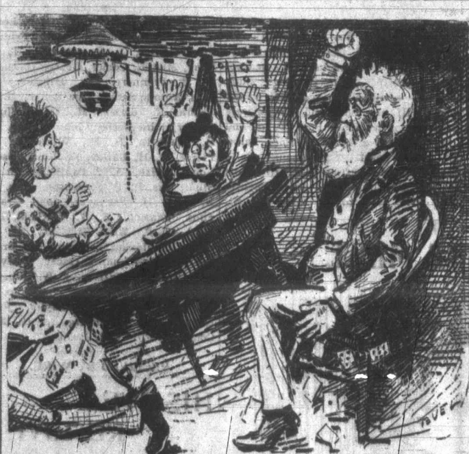
I REMEMBER HER, SHE TRUMPED MY AUNT!