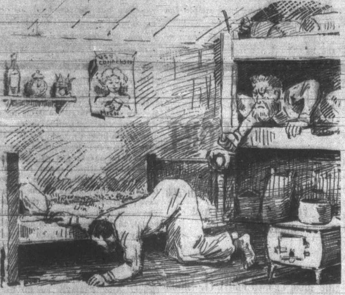
HE LOOKS UNDER HIS BED AT NIGHT.

The Stroller is in sympathy with the spirit of racial pride that causes a few Hebrews to resent the imputation cast upon them by the published telegraphic report that it was a Polish Jew that took a couple of shots at the president of the United States when, perhaps, if the matter was sifted to the bottom it