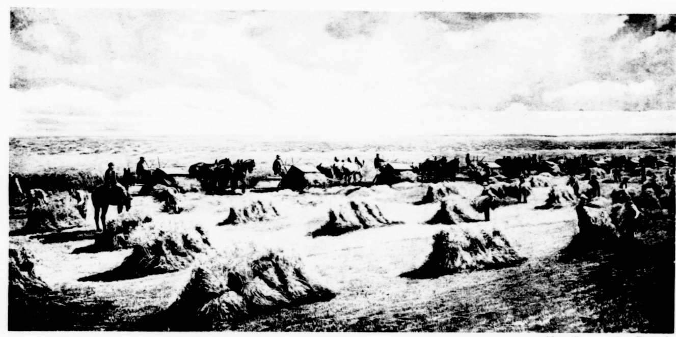
Reaping in Manitoba