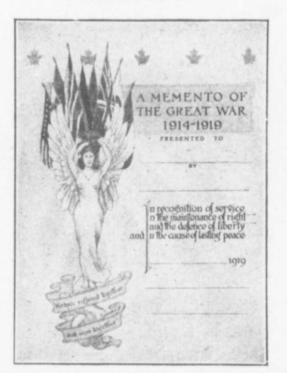
Here It Is

It is a four-page folder, with rich and appropriate full page design, embodying a figure of Victory and the Allied flags as shown above, splendidly reproduced in full colors. Something new and truly Canadian.