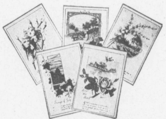
A Group of the 10 cent Cards

OU simply must use Reward Cards and Tickets in classes for Beginners and Primary children if you would obtain the best interest and attention. The children look forward to Sunday School with real pleasure and give better attention when they are given a pretty card or ticket bearing an appropriate scripture verse. The subjects chosen for the pictures of all our Reward Cards and Tickets are carefully selected. They appeal strongly to the smaller boys and girls.