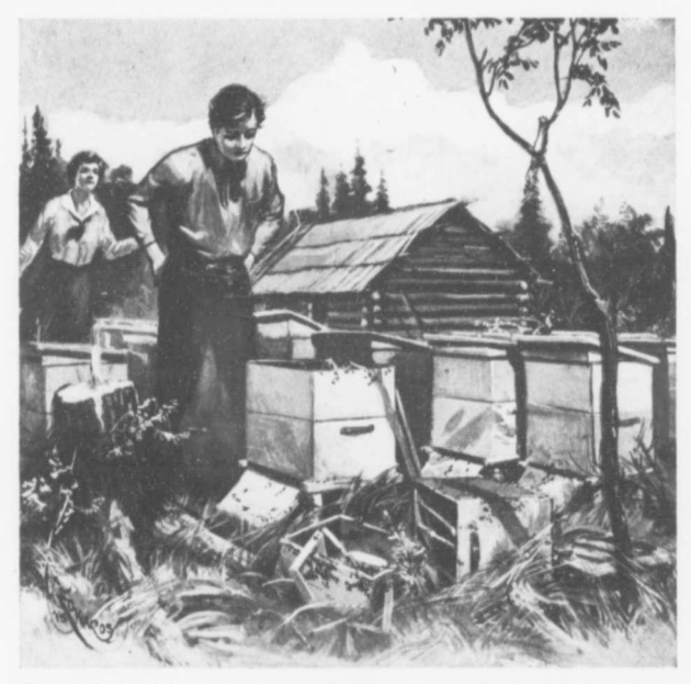
Two of the hives that were farthest from the house had been pillaged