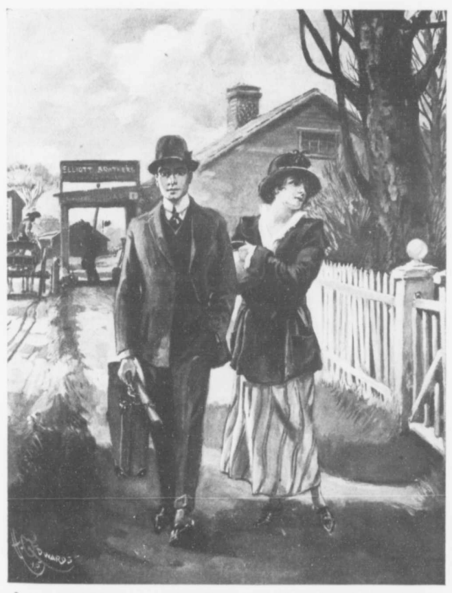
It was not without a secret feeling of misgiving that Alice and Bob bade farewell to Harman's Corners