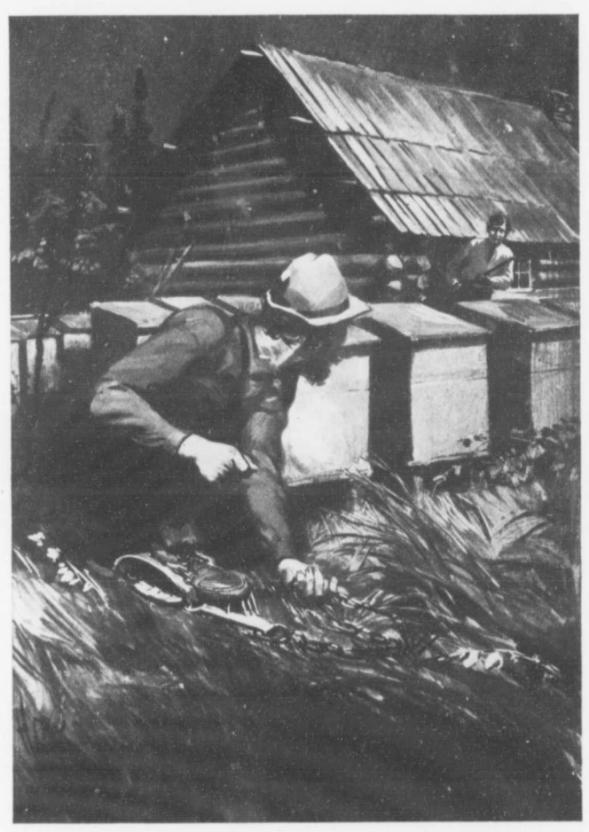
It was not a wild beast in the trap: it was a man!