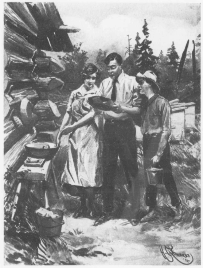
"Poison!" exclaimed Alice. "Why, it must have been meant to kill the bees!"