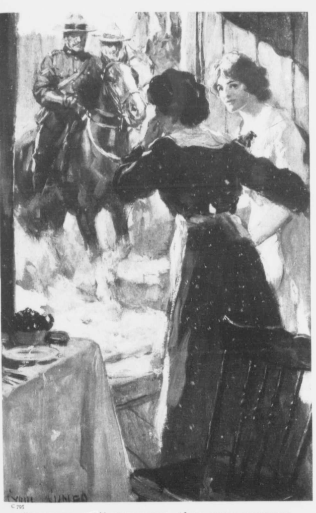
""COURAGE, PAM!' CRIED SOPHY. 'I AM AFRAID SOMETHING MUST HAVE HAPPENED TO YOUR GRANDFATHER'"