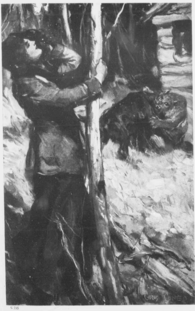
"THE DOG AND THE UNKNOWN FURY WERE ROLLING OVER IN THE DEADLIEST OF COMBATS"