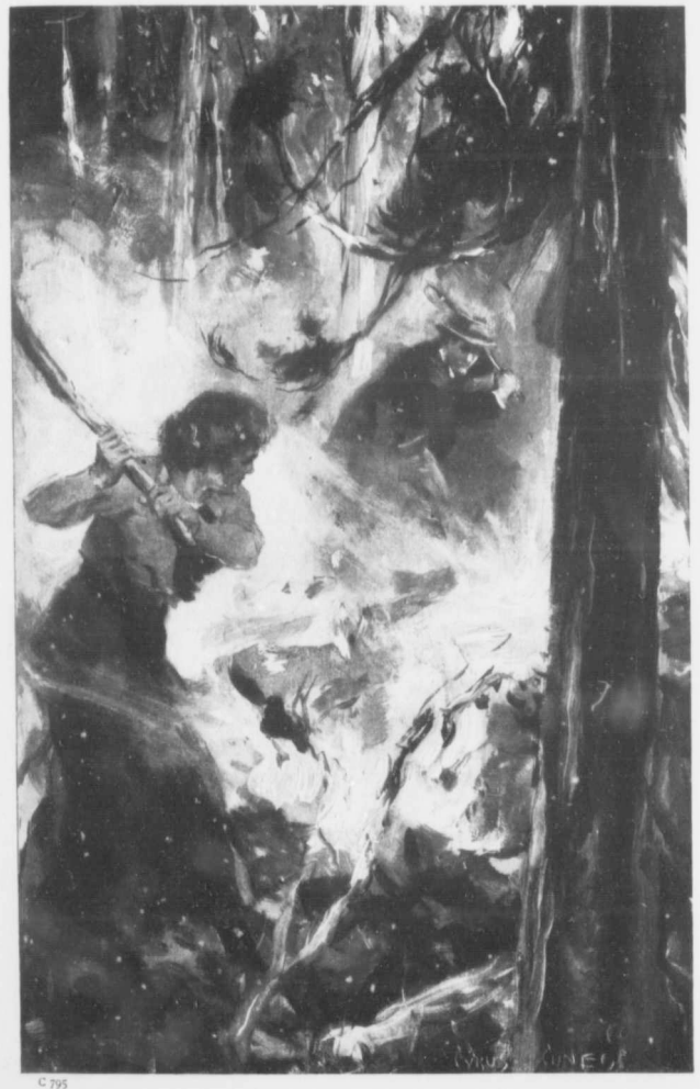
"PAM STARTED FORWARD AND COMMENCED HITTING WILDLY, RAISING A SHOWER OF SPARKS"