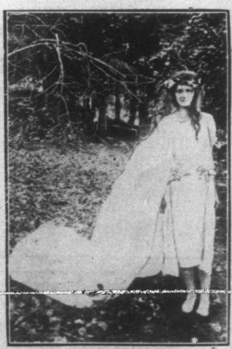
A Grecian Study.