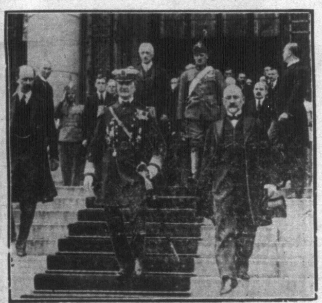
Admiral Horthy, regent of Hungary, after opening the new national assembly.