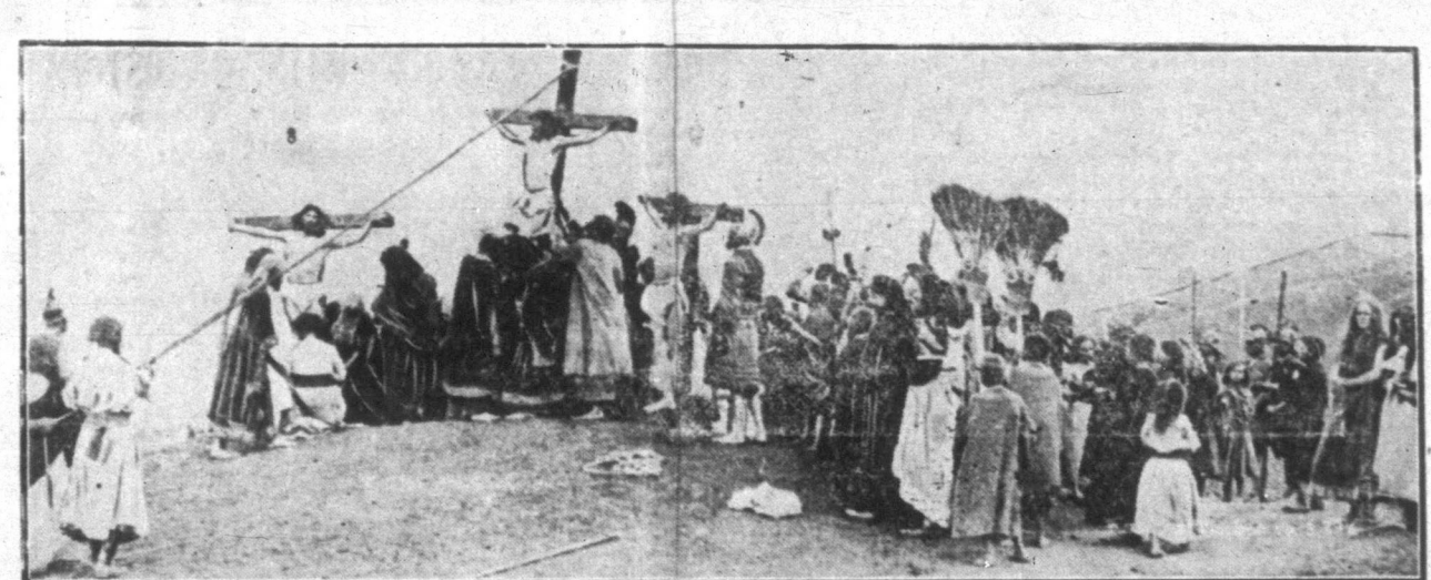
A rival of Oberammergau—Passion Play produced in Mikofalva, village in Hungary.