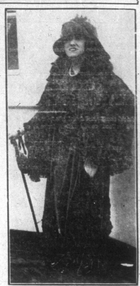
Gloria Swanson as she looked when she arrived in New York recently straight from Paris.