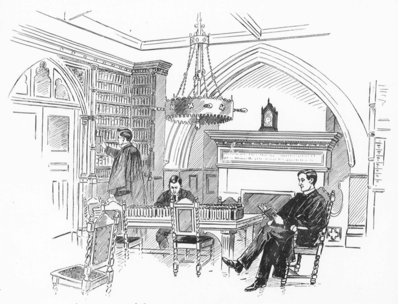
A Gorner of the Gollege Library.