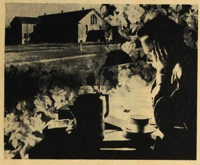
Exams Start April 25