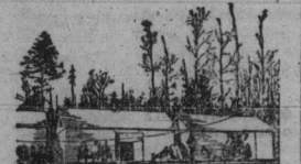
Shack Life at Muskoka Free Hospital for Consumptives.

The trial was the severest in the history of these Muskoka Homes, in which nearly 3,000 persons, stricken by the dread white plague, have been cared for.