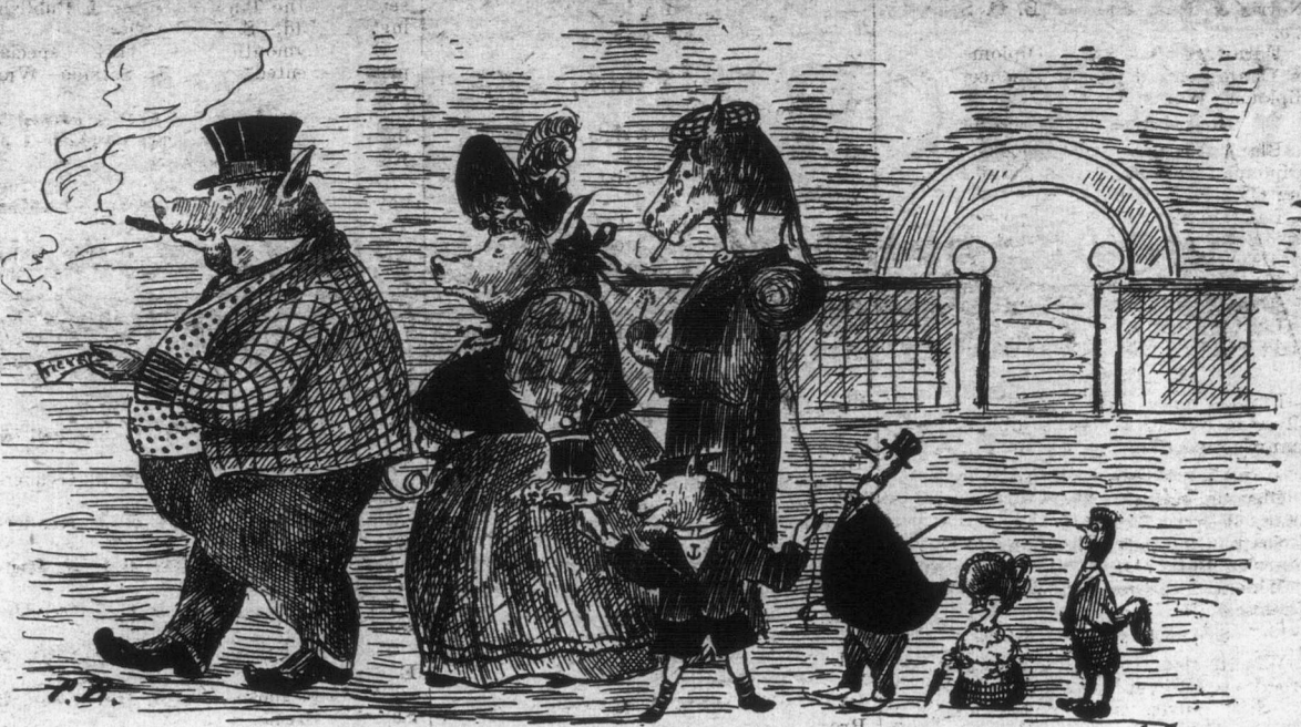
HONORED GUESTS AT VICTORIA'S BIG FAIR.