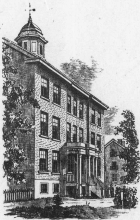
BOYS' INSTITUTE, POINTE-AUX-TREMBLES.

Montreal : PRINTED BY JOHN C. BECKET, 658 & 660 CRAIG STREET.