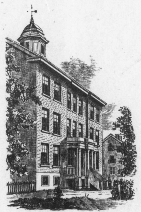
BOYS' INSTITUTE, POINTE-AUX-TREMBLES.